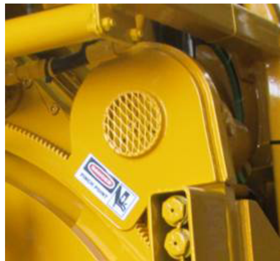
Figure 2: New Style Guard