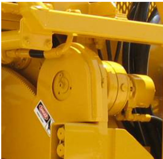
Figure 1: Old Style Guard

Inspect the top drive handler rotate assembly for the updated handler rotate pinion guard. See below for the old style guard compared to the new style guard.