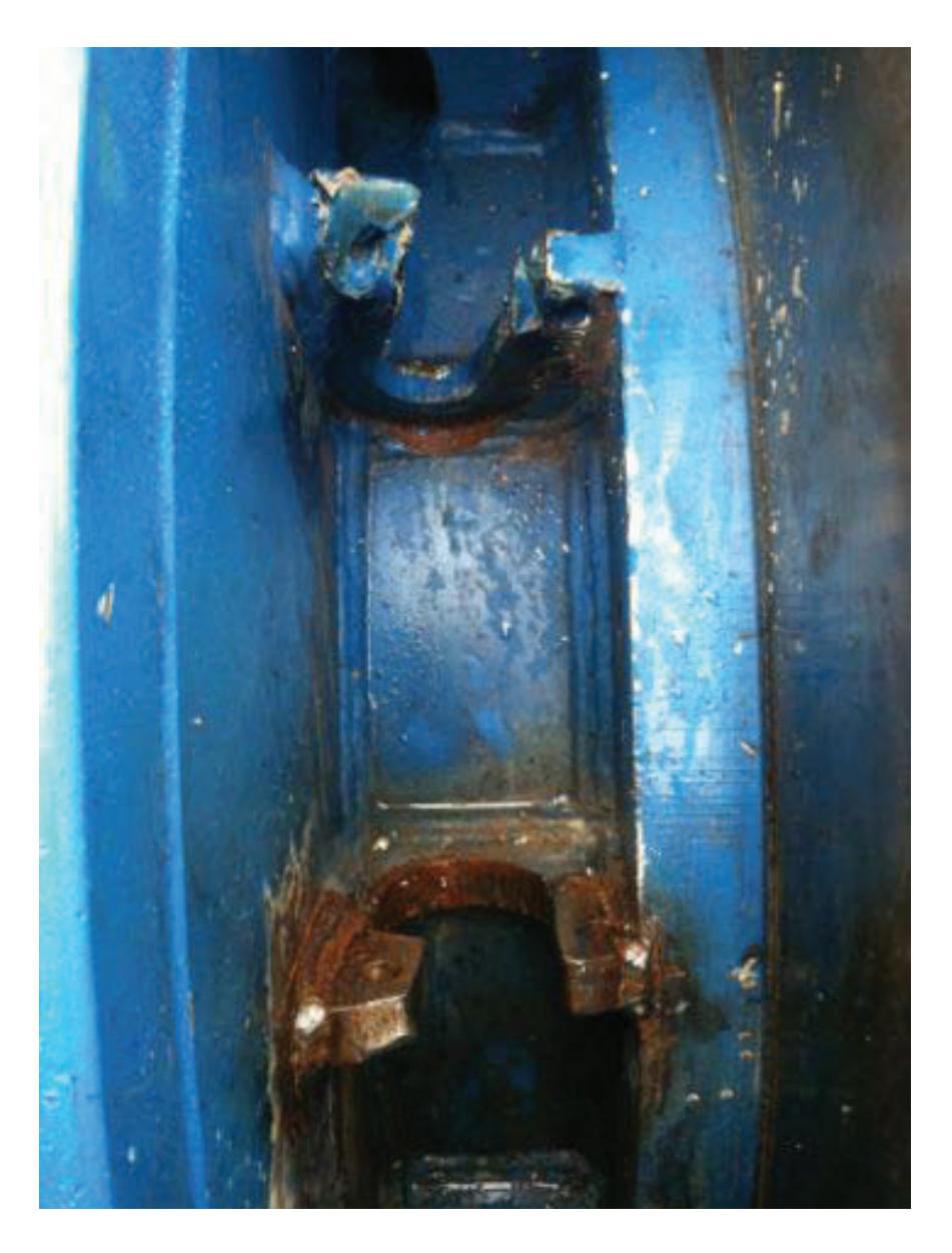
Figure 2: Broken Weld