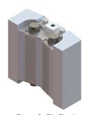
Figure 2: Die Block (Fixed Side)