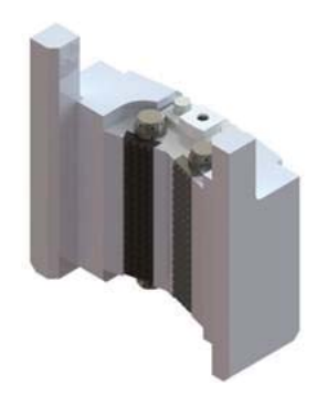
Figure 3: Die Block with Integrated Stops (Cylinder Side)