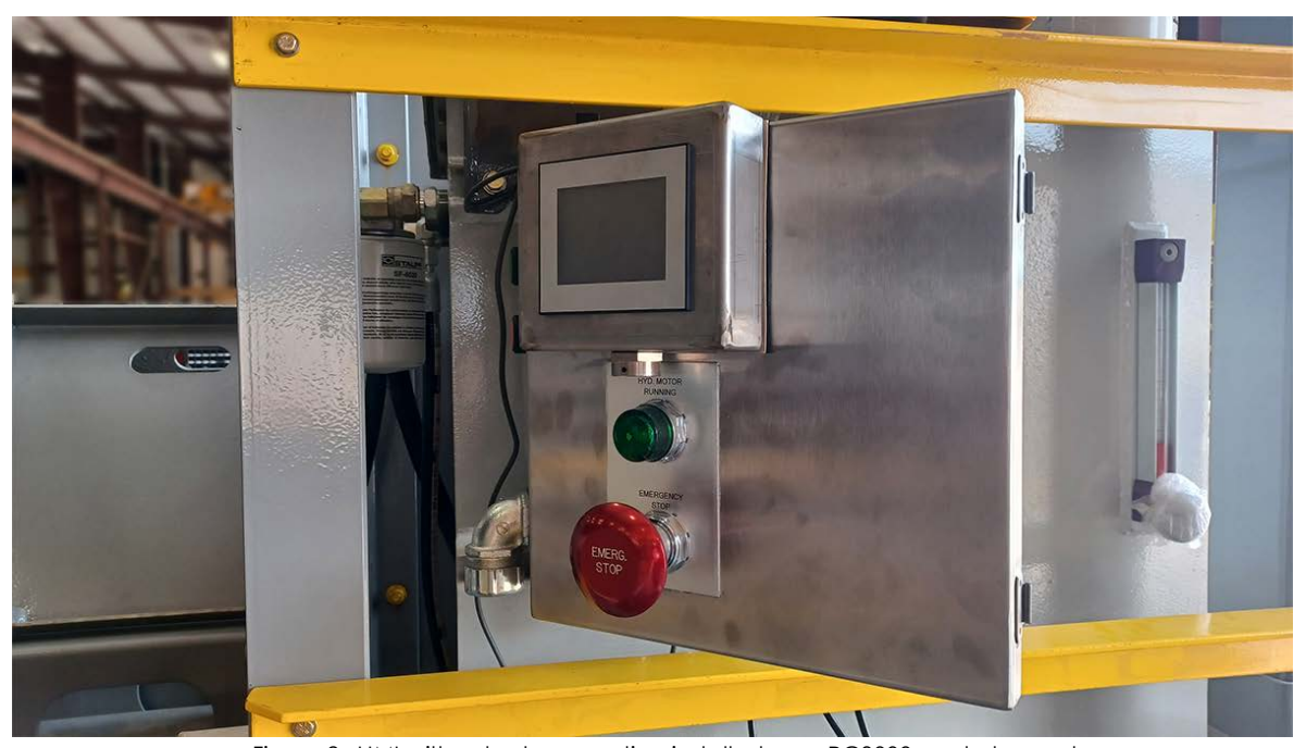
Figure 2: HMI with adapter mounting installed on a PC3000 control console

The new HMI uses the same signal and power wires already in use on the old HMI, only requiring relocating them from the old connectors to a new connector so there is no need to perform any other hardware or cabling modifications. Note that the new connector is screw-terminal only, there is no longer any soldering required inside the control console.