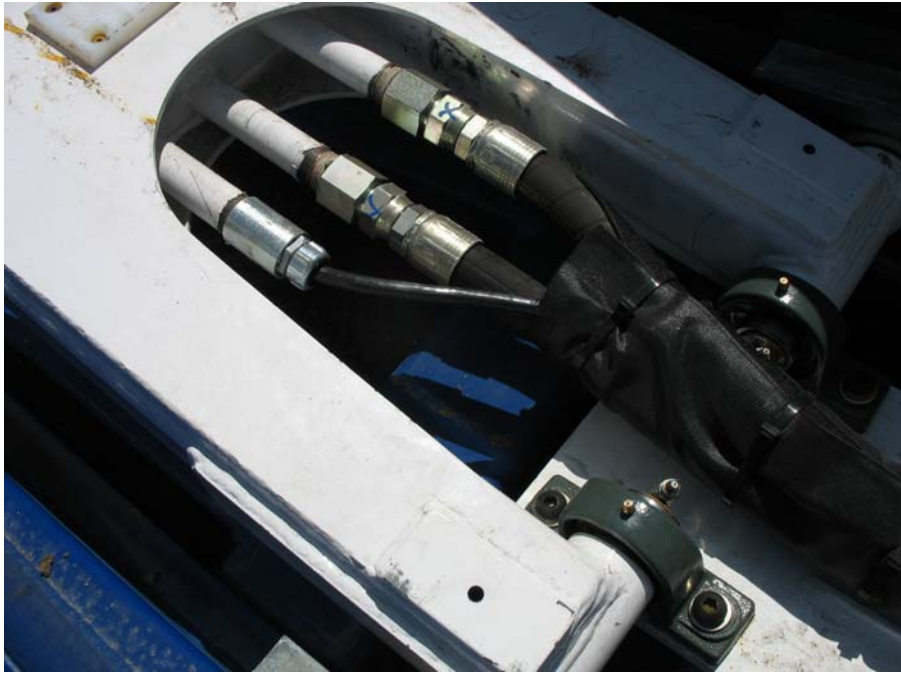
Check cable where it exits the Lift Arm right thru to the junction box in the Carrier.