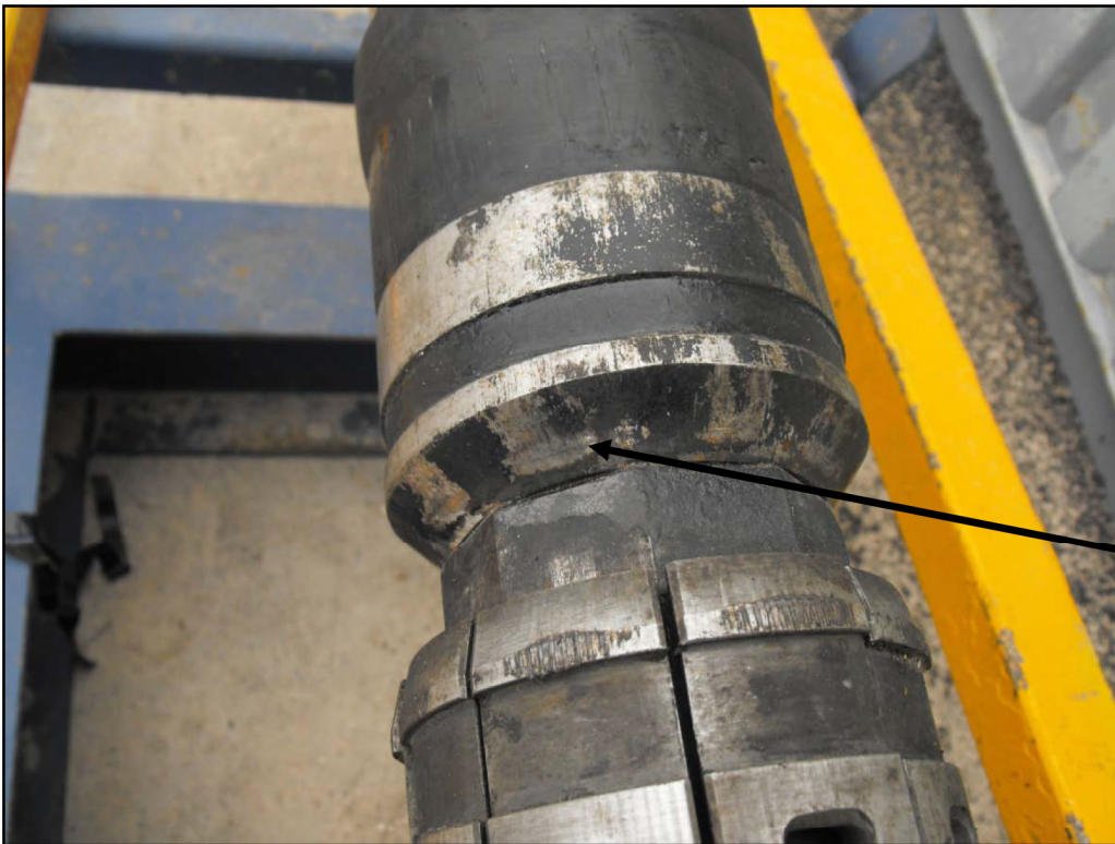
Figure 1 - Close Up View Of ICDS Grapple Tips

Signs of multiple impacts of the grapples at the end of the tool stroke. End of stroke impacts are an indicator of poor radial loading by the tool.