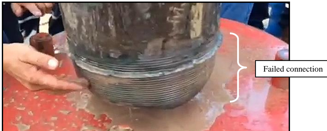
Figure 1: Failed connection on casing joint

It has come to Tesco’s attention that a customer was incorrectly making up a 13-3/8" buttress connection on a casing string. For reasons unknown at this time, the customer could not properly make-up a connection between a newly installed casing joint and the casing string as per the API specifications relating to casing connections or by manufacturer recommended practices for proprietary connections. There were still four threads (four full turns) remaining before the coupling meets the base of the engraved triangle on the casing (see Figure 1 and Figure 2). Instead of replacing this casing joint, as was suggested by Tesco personnel, the company man and tool pusher decided to weld the coupling to the casing. When the string was run again, this particular joint failed, resulting in a “drop-casing” incident. There were no reported injuries to rig personnel.