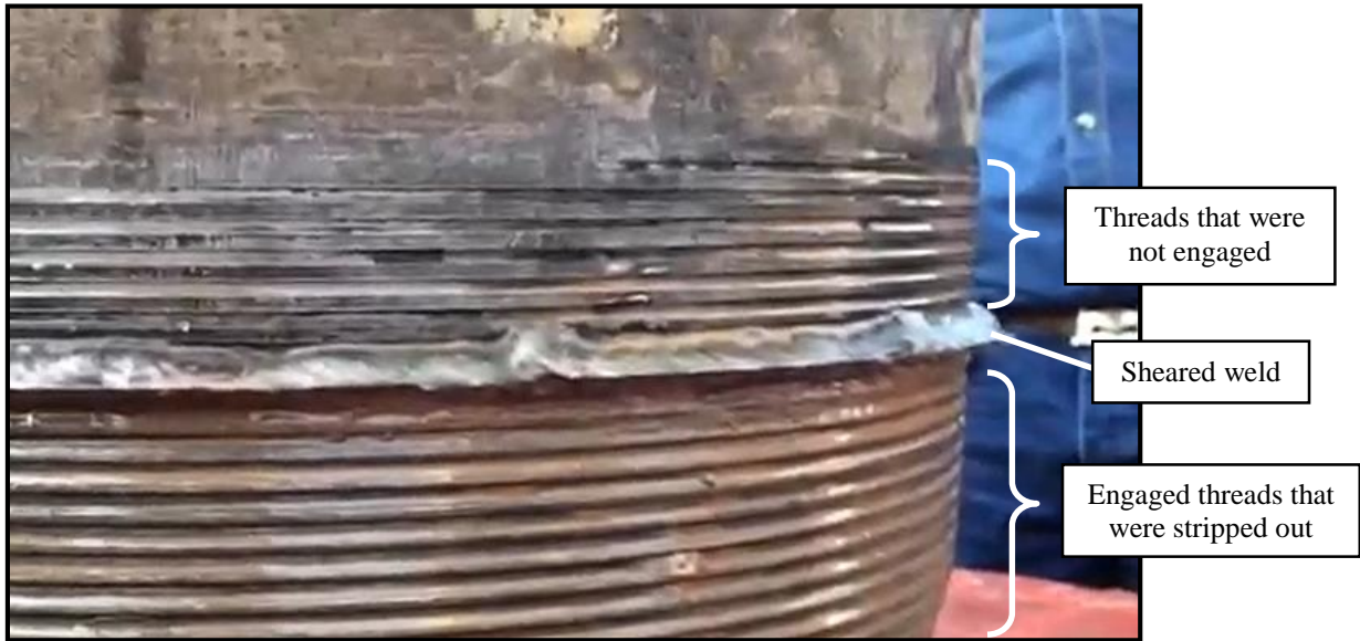
Figure 2: Casing threads that were not engaged and threads that were stripped out