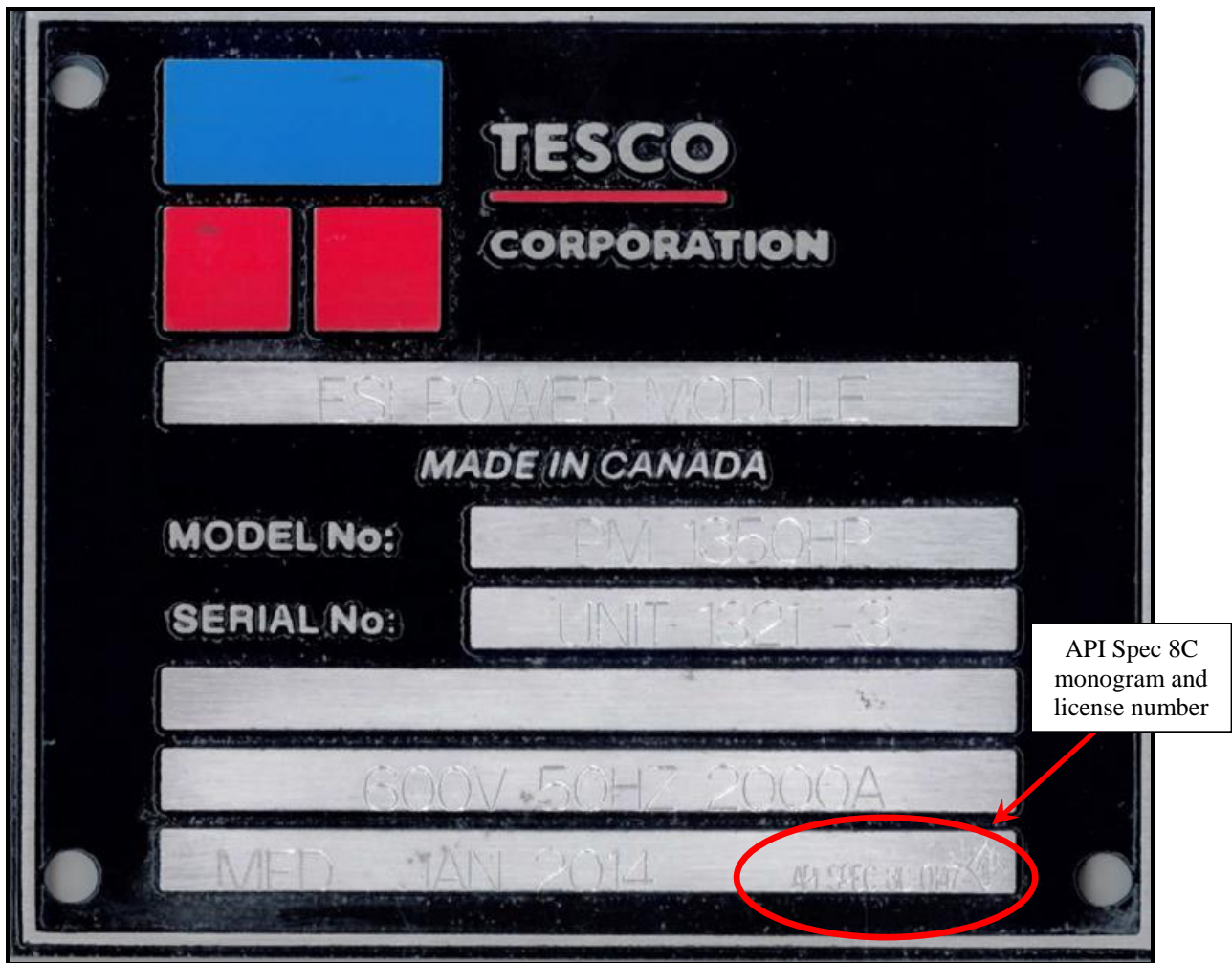
Figure 1: Power module nameplate with API Spec 8C incorrectly engraved on

The nameplates on several of the TESCO Top Drive power modules and manifolds, as well as CDS units, were inadvertently engraved with the API Spec 8C monogram and license number (Figure 1 and Figure 2). The power modules, manifolds and CDS units do not require API certification, therefore the nameplates should not have an API monogram and license number engraved.