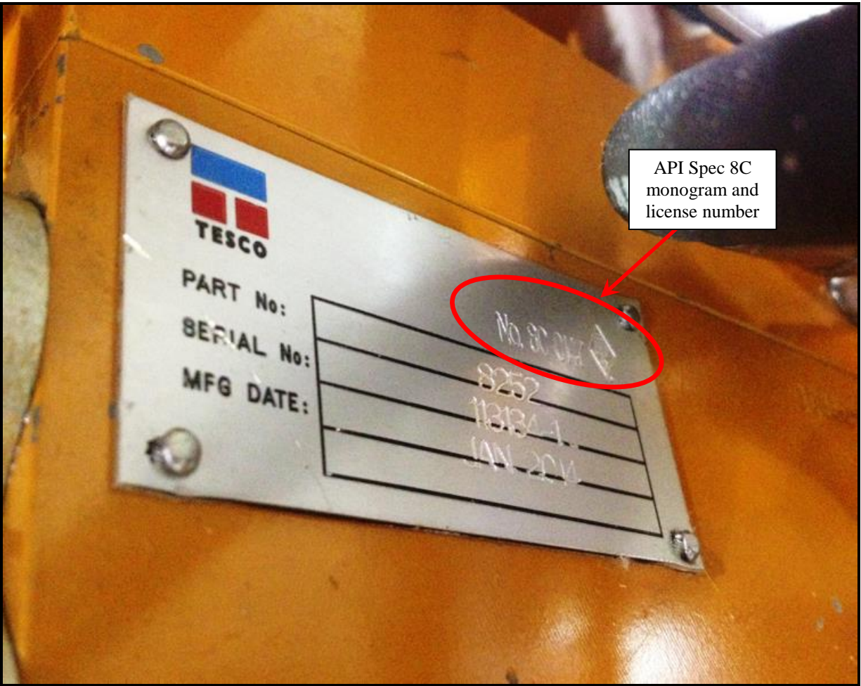
Figure 2: Manifold nameplate with API Spec 8C incorrectly engraved on