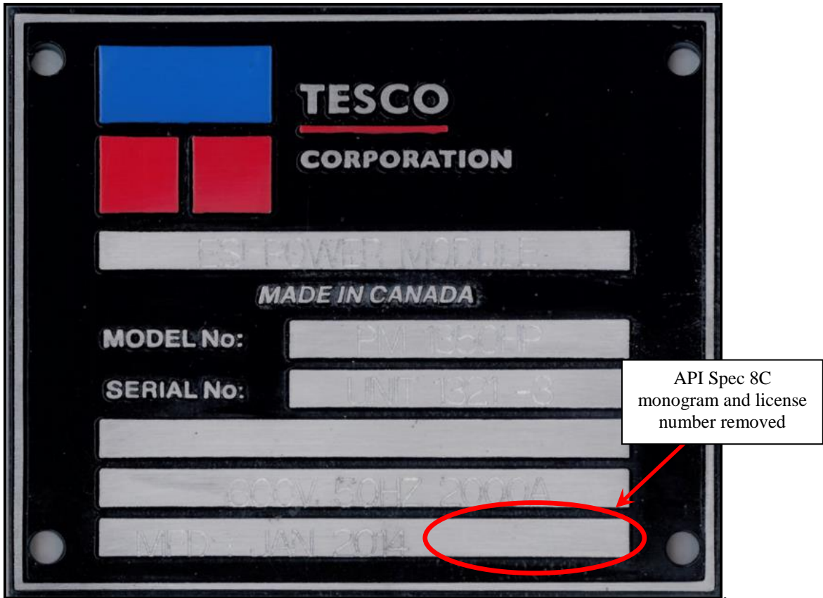
Figure 3: Power module nameplate with API Spec 8C engraving removed