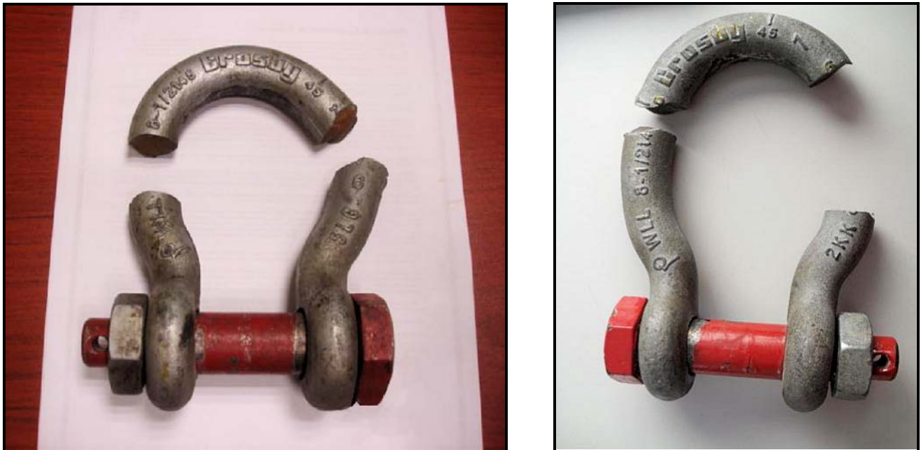
Figure 1: Broken shackle on HCI top drive unit 735 (left) and 957 (right)

The 1 inch G-2130 8.5-ton shackles, manufactured by The Crosby Group, have since been replaced by new ones.