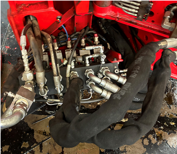
Figure 1: Current tong valve assembly

Installing the new tong valve assembly bracket is not a required upgrade. It is an optional change that may be implemented for improved reliability.