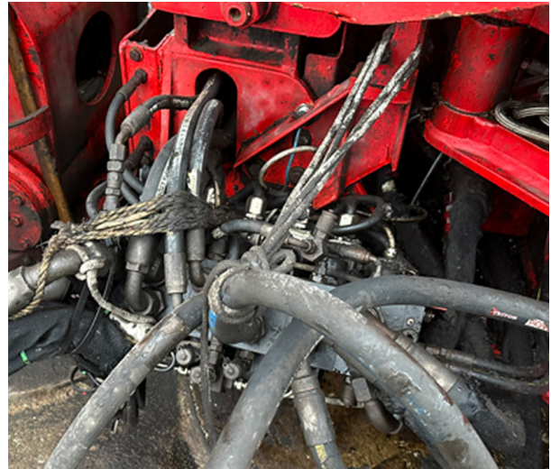
Figure 2: Tong valve assembly after failed mounting hardware